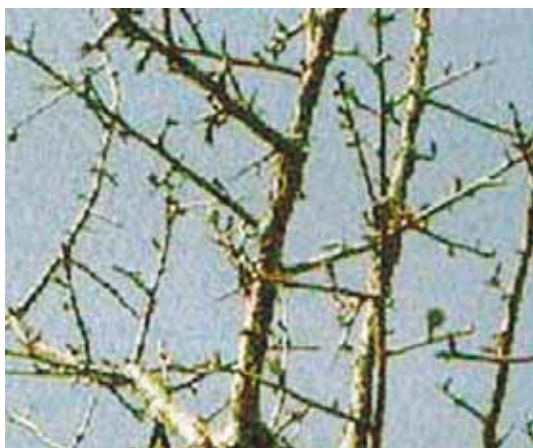
Commiphora wightii – guggal