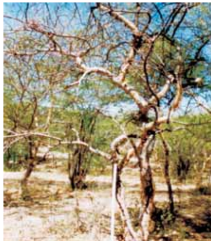
Commiphora wightii – mature leafless tree