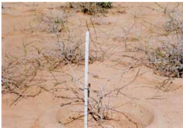
Commiphora wightii – field view